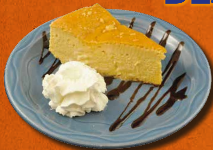
FLAN BY DIANA