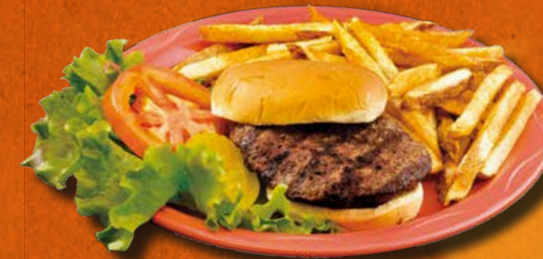
ALL AMERICAN CLASSIC BURGER

*All AMERICAN CLASSIC BURGER – Flame-grilled fresh ground beef served with lettuce, tomato and pickles. Choice of American, cheddar, Monterey jack, Swiss, bleu, or pepper jack cheese. Add a slice of onion at no extra charge. 9.99 Add the kitchen sink...see the extras below.