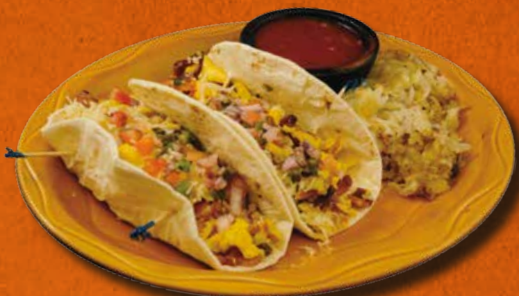
BRYN'S BREAKFAST TACOS

BREAKFAST BURRITO – Two eggs scrambled, with hash brown potatoes rolled in a flour tortilla, smothered with green chile and cheddar cheese. 10.29 Add ham, bacon, sausage, ground beef or Polidori chorizo 2.99