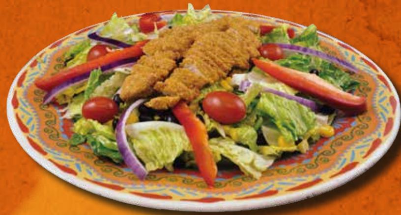
SOUTHWEST CHICKEN TENDER SALAD

TACO SALAD – Ground beef, bean or chicken, green chile, assorted cheeses piled high on top of a bed of lettuce, tomato, and covered with sour cream and guacamole. 10.29